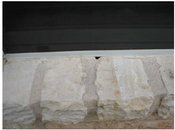
Poorly Detailed Sill Masonry