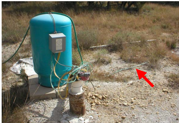
Well Head and Pressure Tank (all that exposed wiring is interior-grade, energized supply cabling)