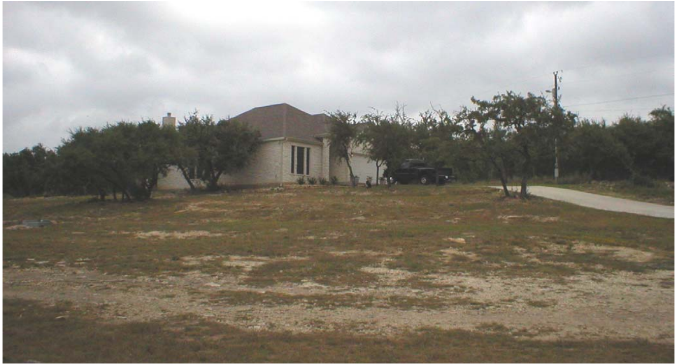
Front and Left Elevations