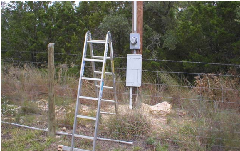
Service Entrance (over livestock fencing?)