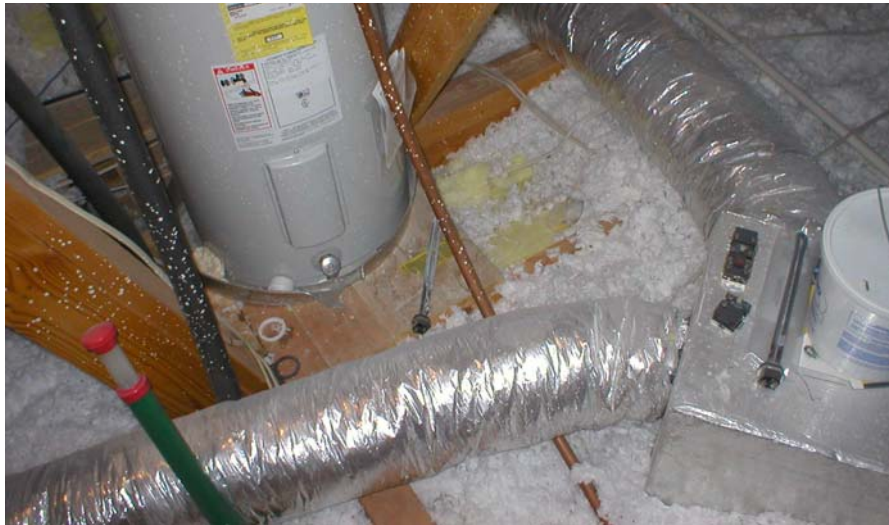
Water Heater (relief valve seized, torn drain pan, risers not blocked, no disconnect, no service decking, etc.)