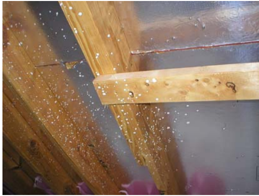
Inadequately Supported Rafter Lap (right slope)