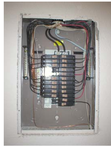
Garage Branch Subpanel