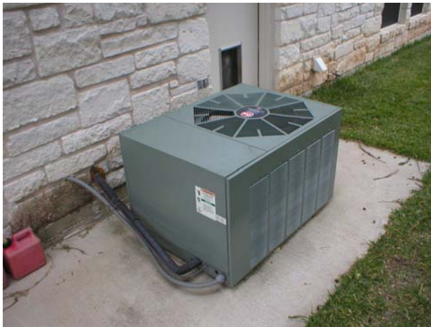
Condenser Unit (right side)