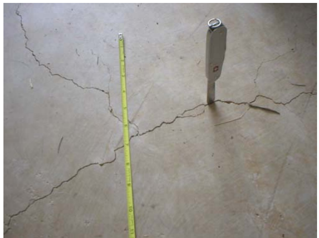
Shrinkage Cracks (at garage floor surface)

As regards structural integrity, the location and morphology of the visible cracks at the upper slab appear typical for those caused by excessive concrete cure shrinkage. 4 Indicative of poor installation practice, this type of cracking is very common in rural residential slab-on-grade construction. At this point they do not appear severe enough to affect the slab structural function, although they can affect other slab functions, notably flooring. Ceramic tile installed without a crack barrier membrane may reflect cosmetic cracks. Where some slab movement occurs, shrink cracks can also cause mismatch lines in sheet vinyl flooring. Carpet, wood and laminate flooring all perform acceptably on cracked substrates.