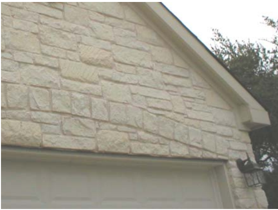
Flexural Cracks above Lintel (esp. at right corner)