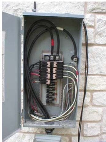
House Load Center (right wall)