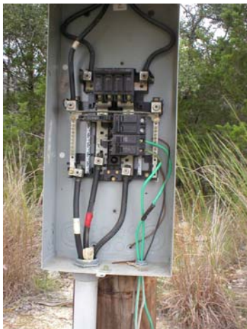
Service Entrance (on pole)